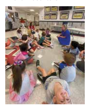
Career Day Fun.