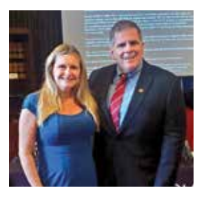
Montgomery County Update.