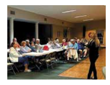
Neshaminy Falls Town Hall.