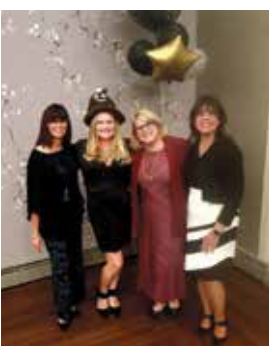
Celebrating Montgomery Township Sewer Authority.