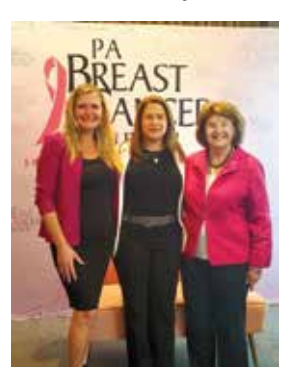
PA Breast Cancer Coalition Celebrates 30 Years.