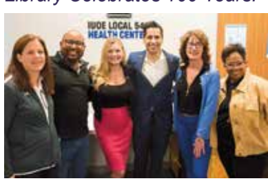
Jarrett Nature Center Visit. Policy Hearing at Operating Engineers on Health Centers.